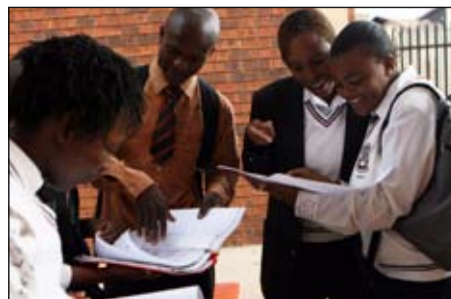
GO FOR GOLD: Top tips to make sure you get the marks you deserve this year PG 3