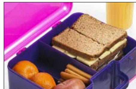
LEKKA LUNCHES: Healthy snacks for your school lunch box PG 4