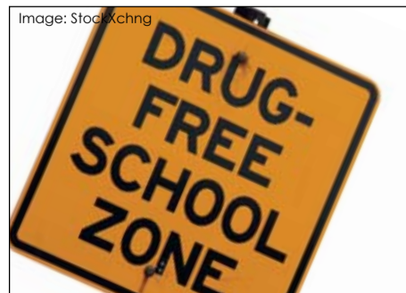
SCHOOL ROOLZ: Random drug testing PG 2