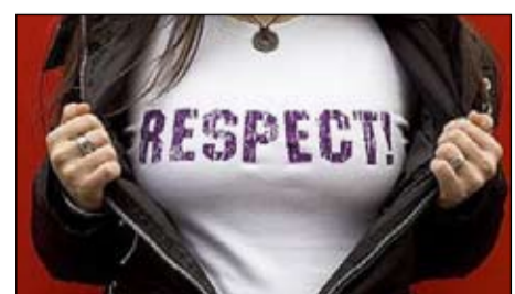
RESPECT: Believe in yourself and everyone else will too PG 3