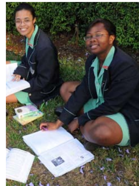
STUDY BUDDIES: Studying with a friend can help you stay motivated

You can read more about the Bill of Responsibilities for the Youth of SA on page 3.