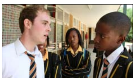
EQUAL BUT DIFFERENT: Stand up for your rights PG 2