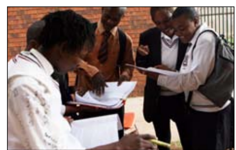
SCHOOL TOOLS: Make a fresh start PG 2